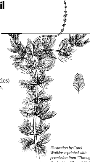
Illustration by Carol Watkins reprinted with permission from "Through the Looking Glass, A Field Guide to Aquatic Plants" LD04