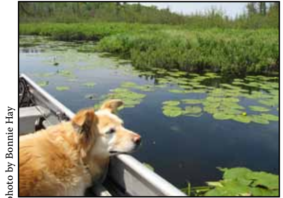
Sam surveys the outlet to Gratiot Lake, the Little Gratiot River, from the Jamison boat. There are a series of beaver dams along this river creating wetlands. The dams also effect lake water levels and slow the "flushing" of lake water.

The solution: pour white vinegar into the water overflow every week or so. Let it sit at least 20 minutes before running water. The added acidity kills the larvae. I guess a permanent fix would be to replace the sink with one without an overflow opening.