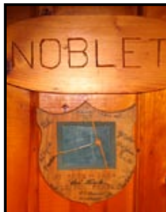
Detail from gun rack at the Noblet Field Station