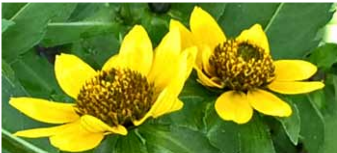
Nodding bur-marigold, Bidens cernua , on Gratiot Lake western shoreline

We miss a Gratiot Lake neighbor and friend who recently passed away