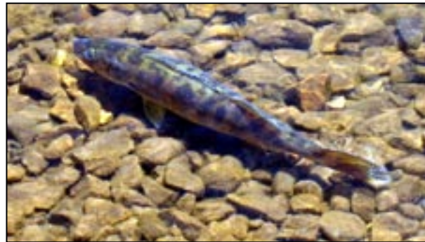
Walleye caught and released at recent Keweenaw fishing tournament.