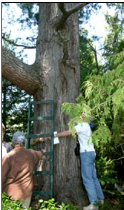
Old White Pine which snapped on GLC Preserve as a result of early May storm gets a hug from visitors.